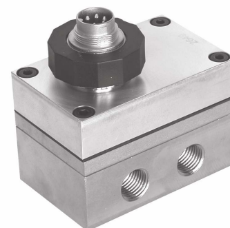
Medium pressure type