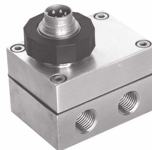
Low pressure type

The analog output is freely scalable via the interface. For flow measurements, the root of the differential pressure can also be outputted. The calculated value can be outputted via an analog interface (0...10 V or 4...20 mA).