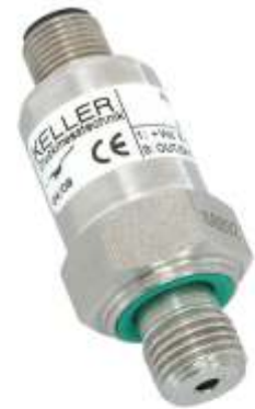
Series 23 SY

A modular concept is used, with fast and economical production achieved by using off-the-shelf sensors. Numerous options and variations are available to meet customers' specific requirements: Pressure ranges, pressure ports, signal outputs, electrical connectors, etc.