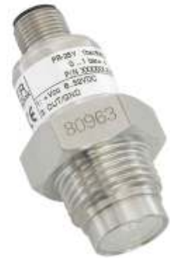
Series 25 Y